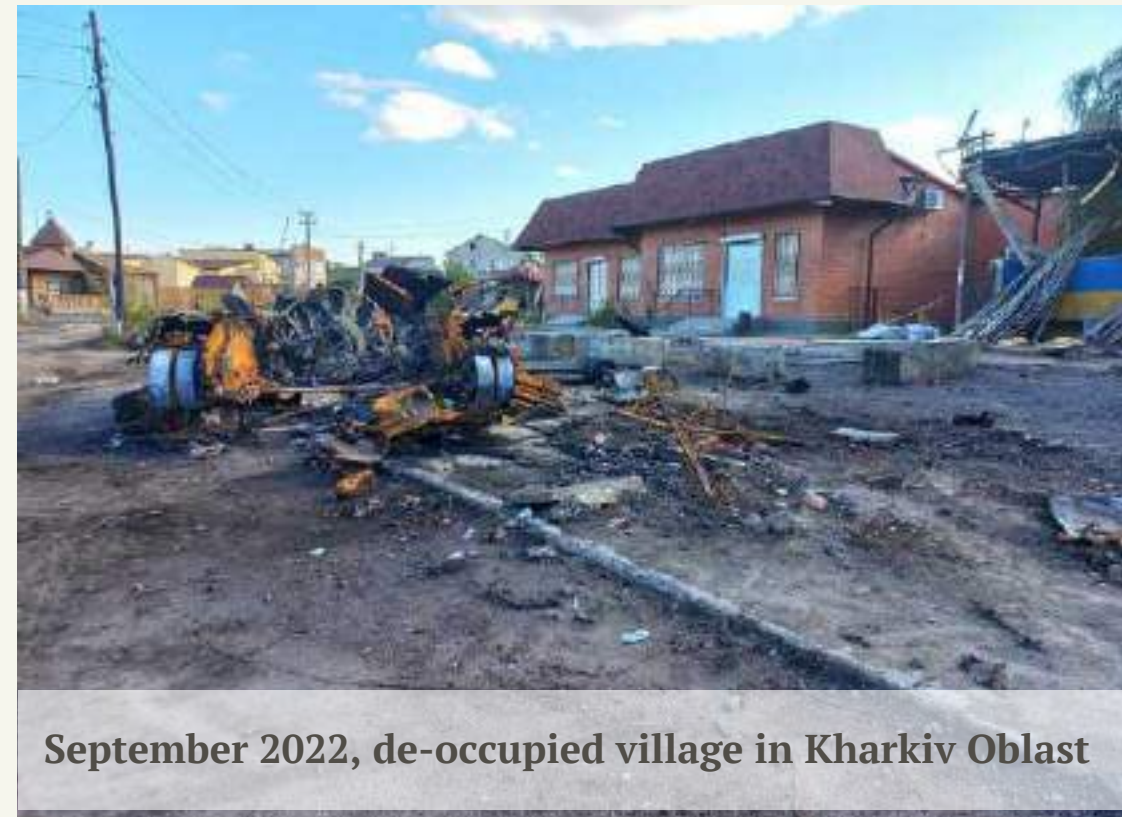
September 2022, de-occupied village in Kharkiv Oblast