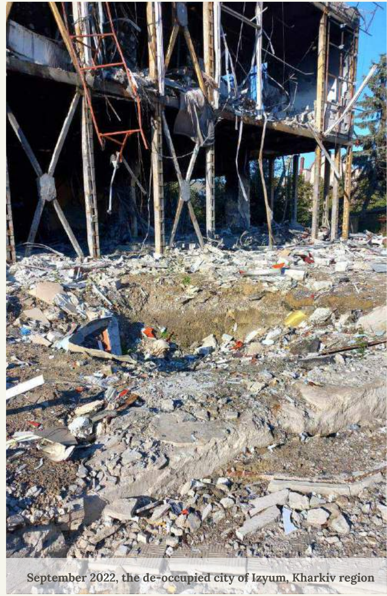
September 2022, the de-occupied city of Izyum, Kharkiv region