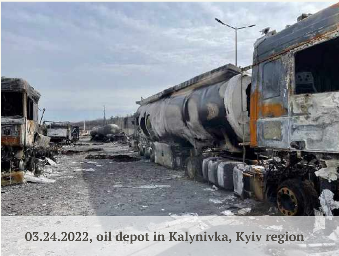
03.24.2022, oil depot in Kalynivka, Kyiv region