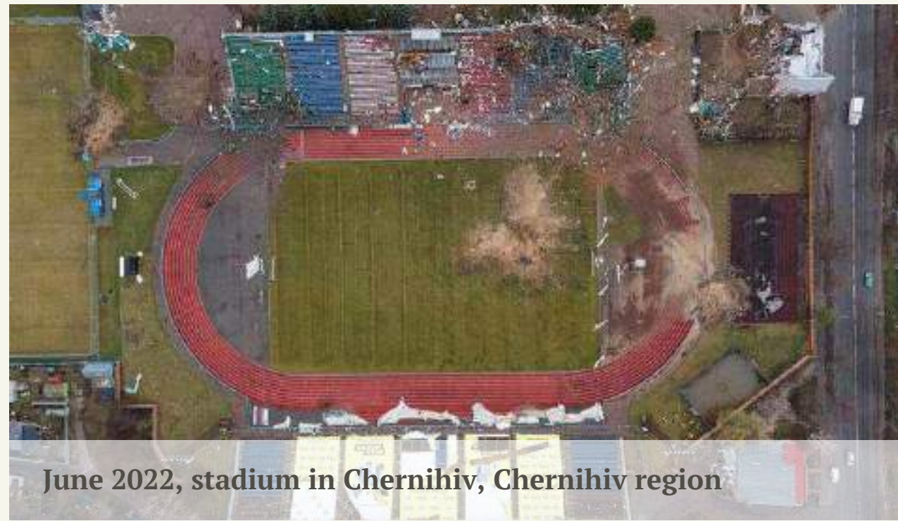
June 2022, stadium in Chernihiv, Chernihiv region