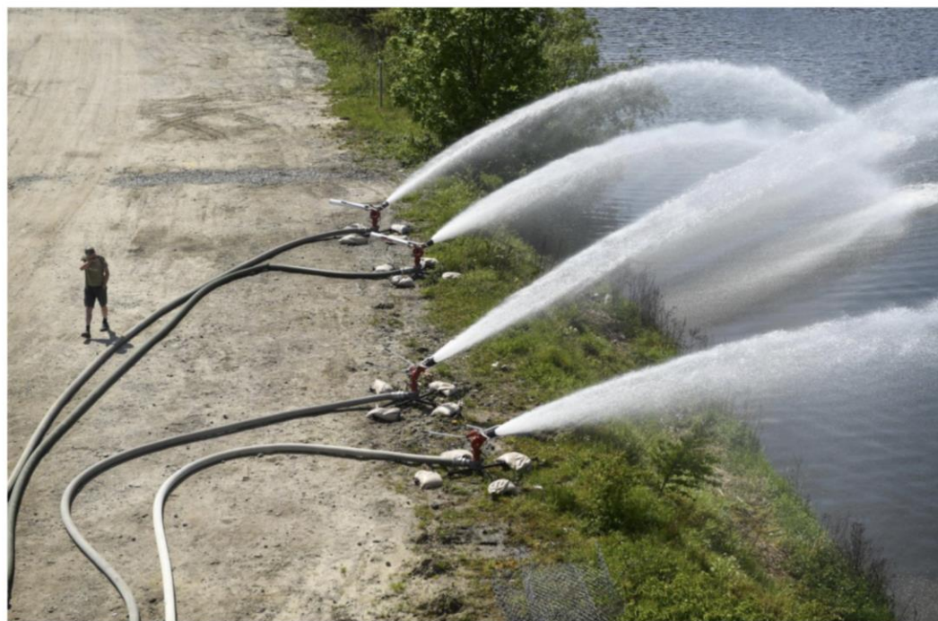
De Gentse brandweer pompt extra zuurstof in de Schelde met waterkanonnen.

Vlaanderen kon door een grootschalige operatie zijn vissen redden, maar voor Wallonië was het te laat. 'Wij zullen de schade op de vervuiler verhalen.'